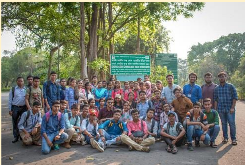
Visit to Botanical Garden