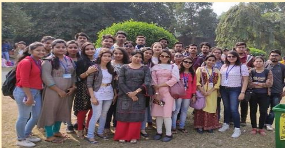
Educational trip to Zoo