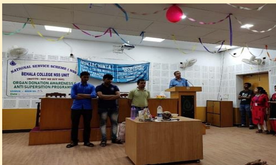
Awareness Program on Organ Donation and Anti Superstition