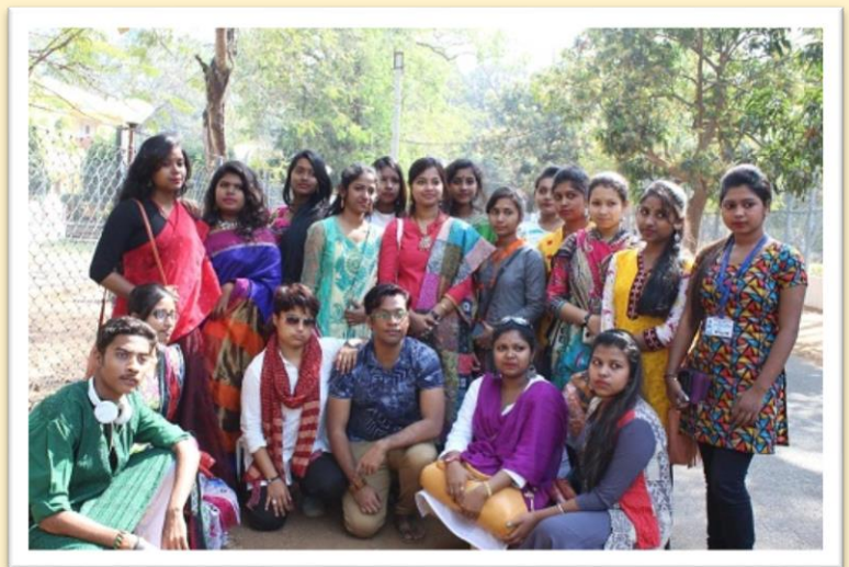
Departmental Excursion to Shantiniketan