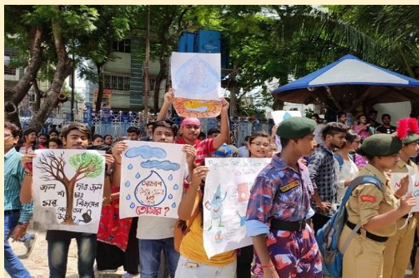
Observance of World Environment Day