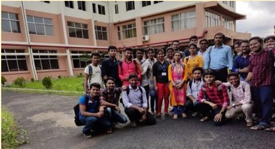
Students' visit to Techno India, Batanagar