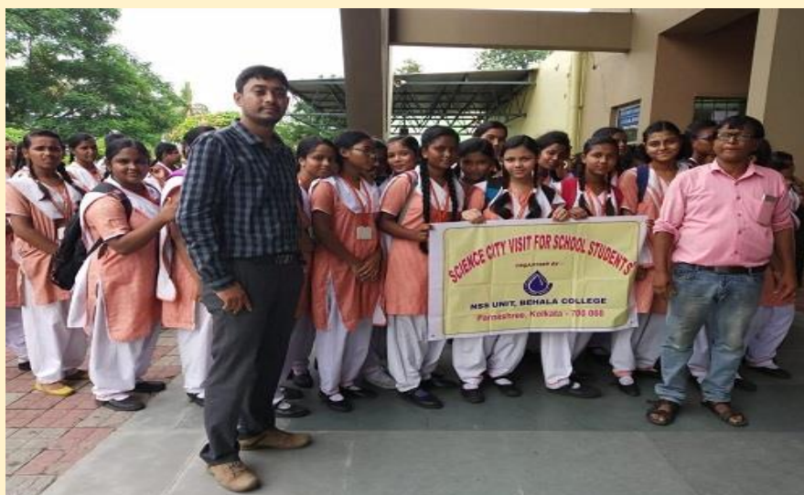
Visit of school students to Science City