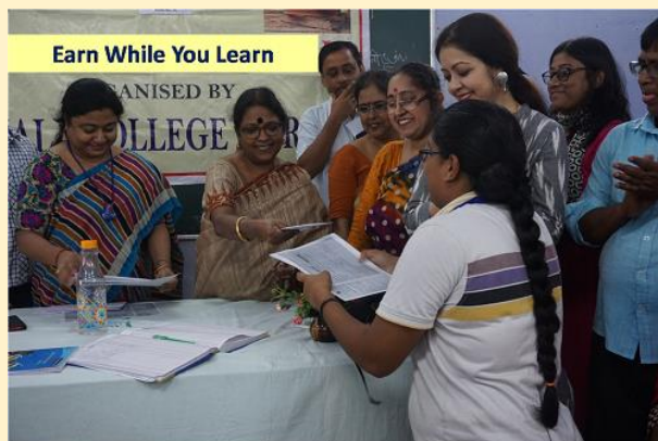
'Earn while you learn'