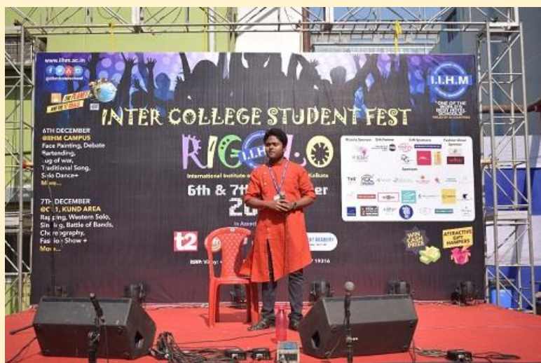
Participation in Inter-college Students' Fest