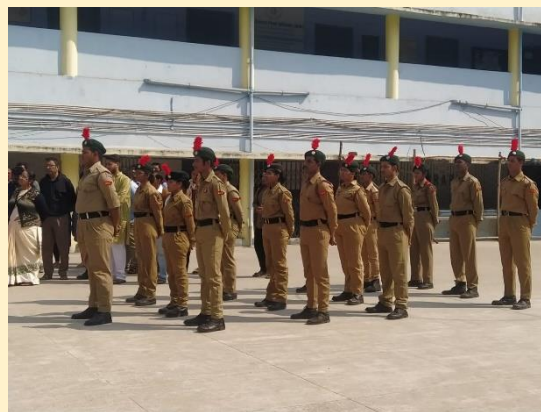
Celebration of Republic Day