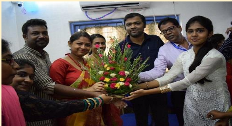
Departmental Teachers' Day celebration