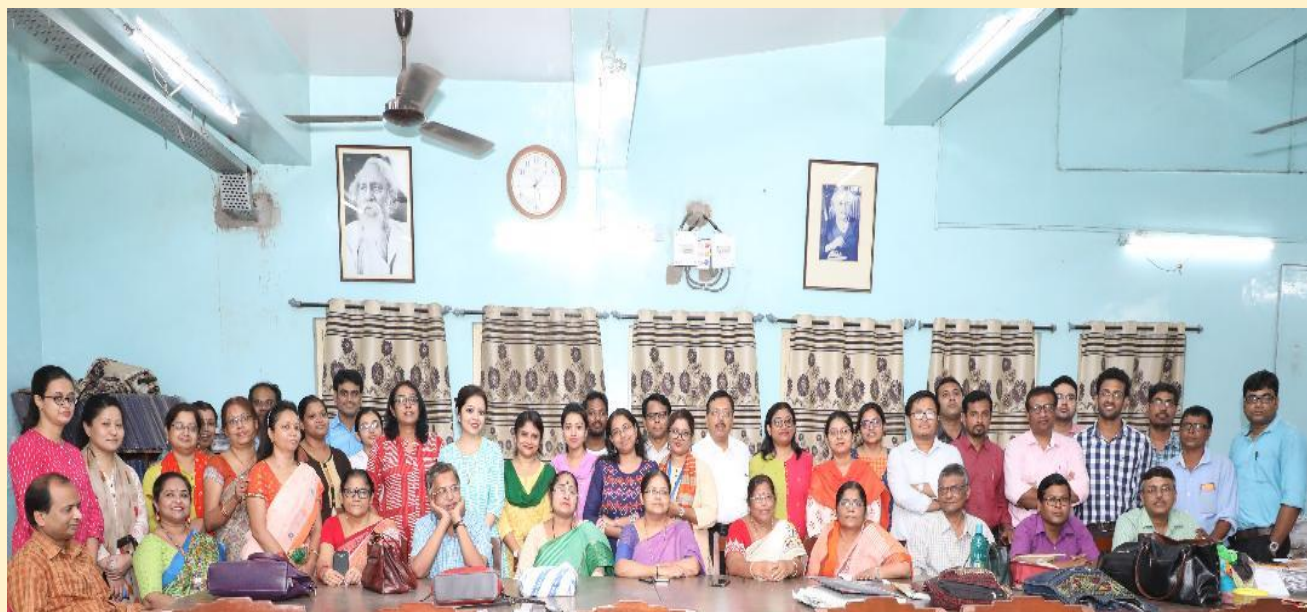
Behala College Faculty