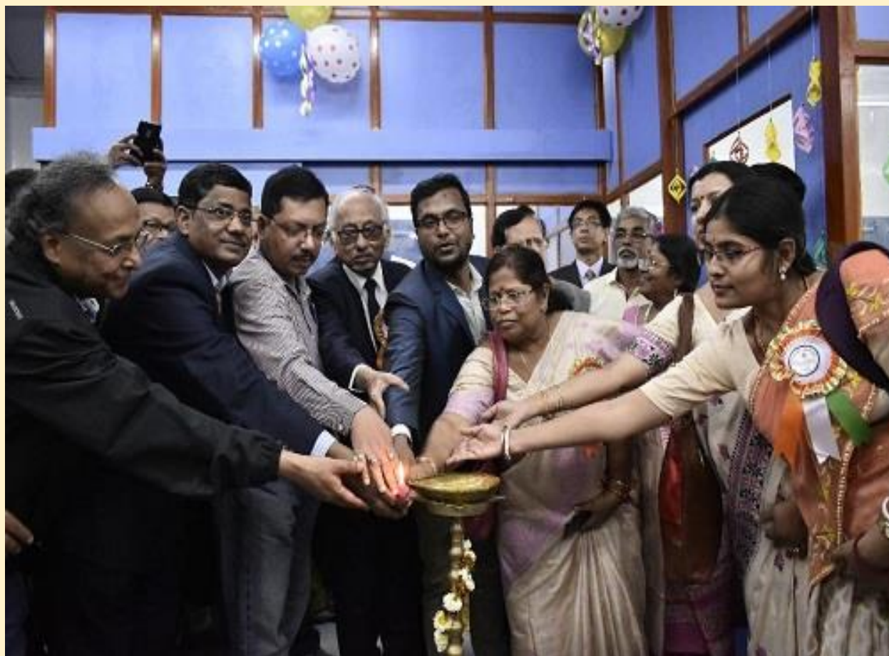
Inauguration of PG Chemistry laboratory