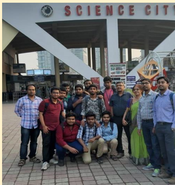
Visit to Science City