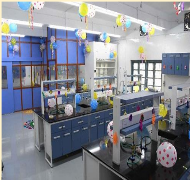
Chemistry PG Laboratory