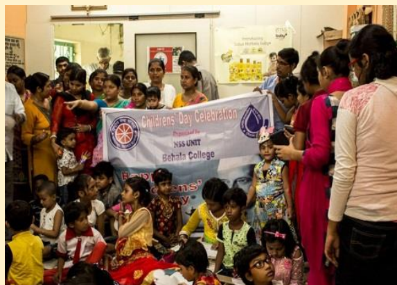
Celebration of Children's Day