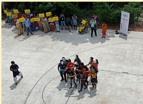
Awareness program on Child Sexual Abuse in collaboration with RAHI Foundation

In the event of aforesaid acts being established beyond reasonable doubt by the Disciplinary Committee of the Institution, the student/student concerned shall be issued compulsory transfer certificate.