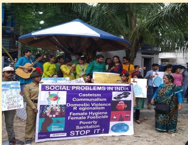
Social Awareness Program