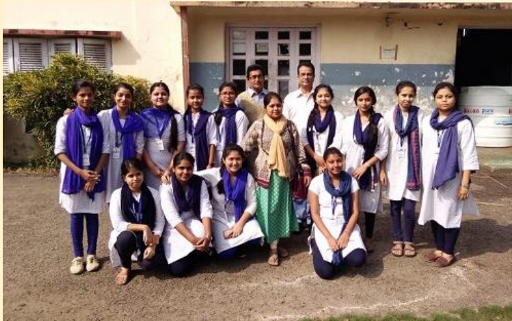
Departmental visit to Dairy Industry