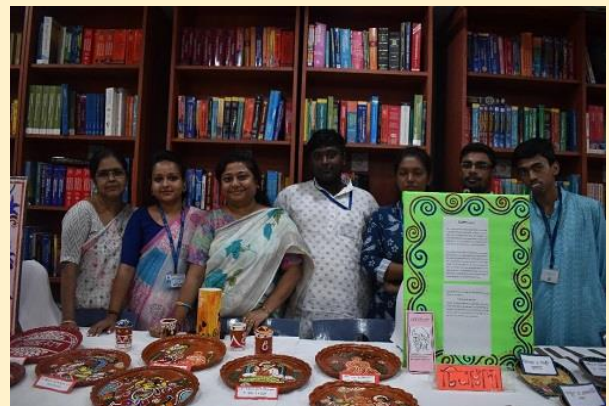
Celebration of Rabindra Jayanti