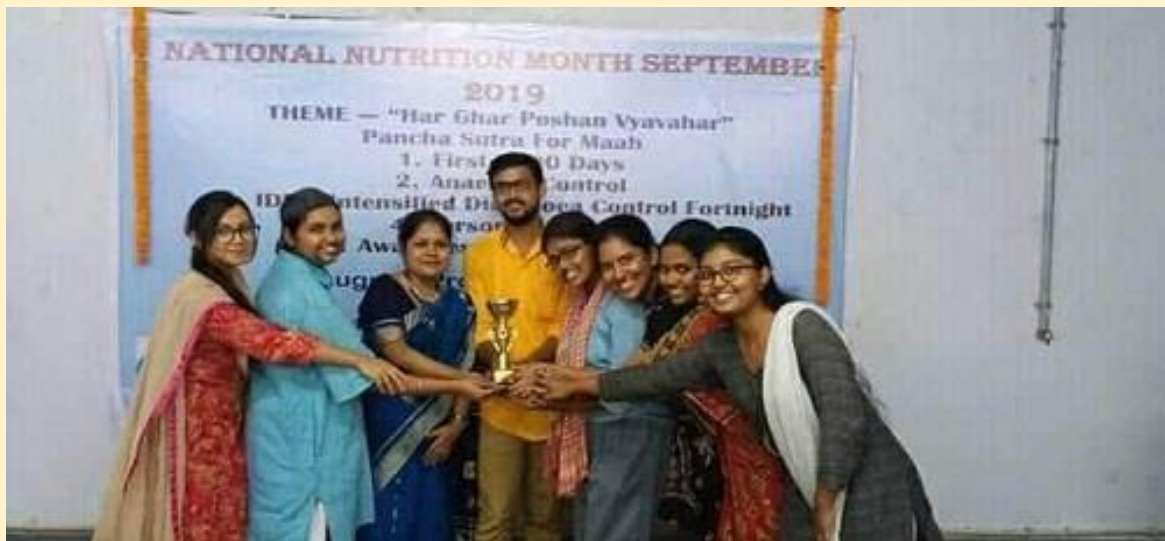
Celebration of Nutrition Week