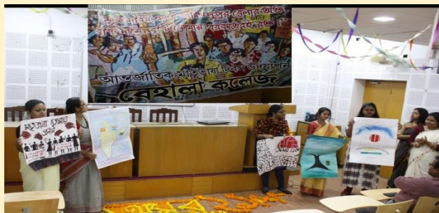
Celebration of Mother Language Day