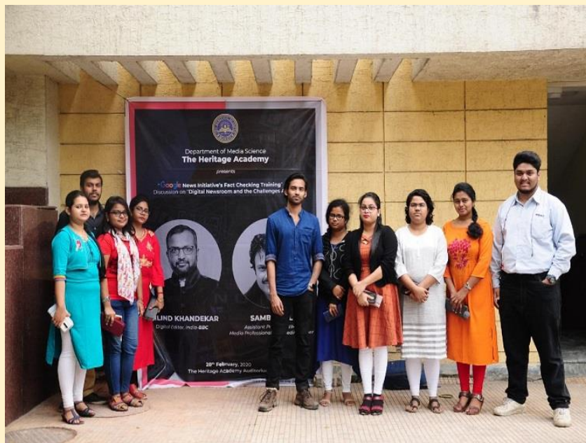
Participation of students in Training and Discussion at The Heritage Academy