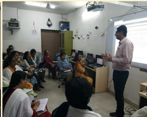
Faculty Development Program