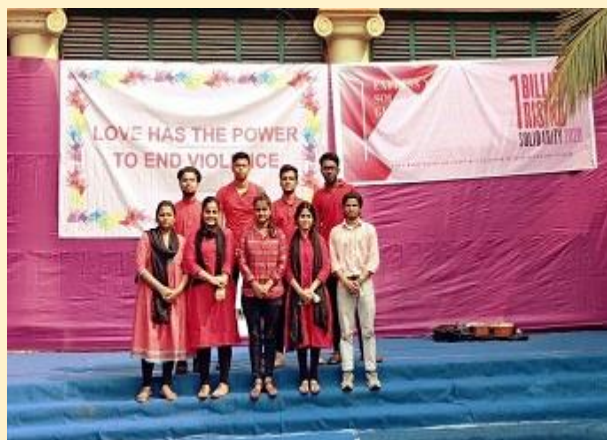
Participation of students in "One billion rising" – a campaign to end violence against women