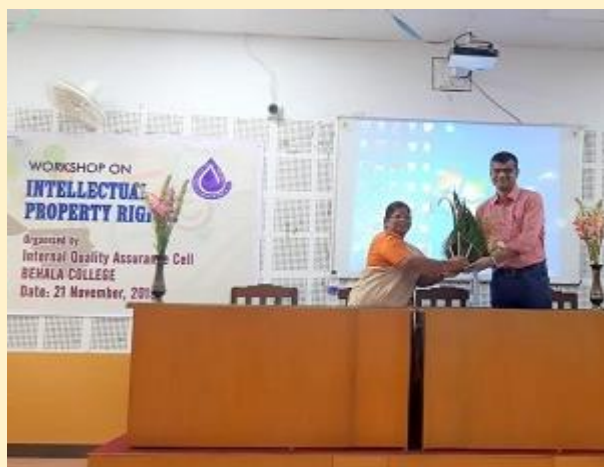
Workshop organized by IQAC