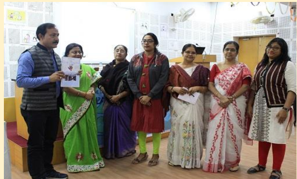
Celebration of Library Day