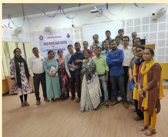
Seminar on Save River Save Water