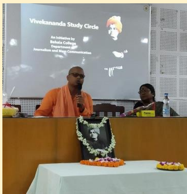
Workshop by Vivekananda Study Circle