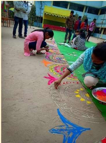
Rangoli by students

The Students' Union organizes various co-curricular activities like Annual Sports, Cricket and Football tournament, Intra College Games and competition. It celebrates different important days and Saraswati Puja with much grandeur. The Union organizes cultural programmes on Freshers' Welcome and College Social.