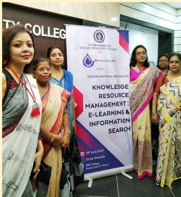
National seminar in collaboration with Bhawanipore Education Society College