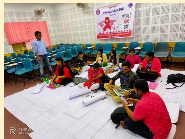
Poster competition on World AIDS Day