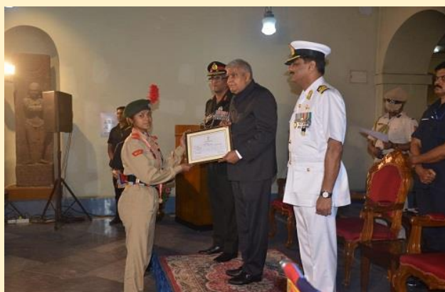
Our cadet receiving Governor's Award