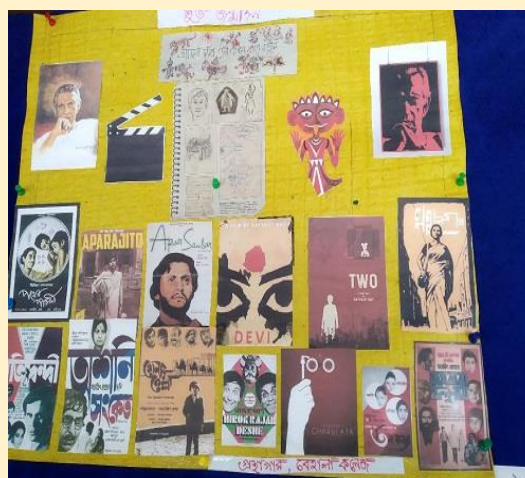
Celebration of Satyajit Ray's birth centenary