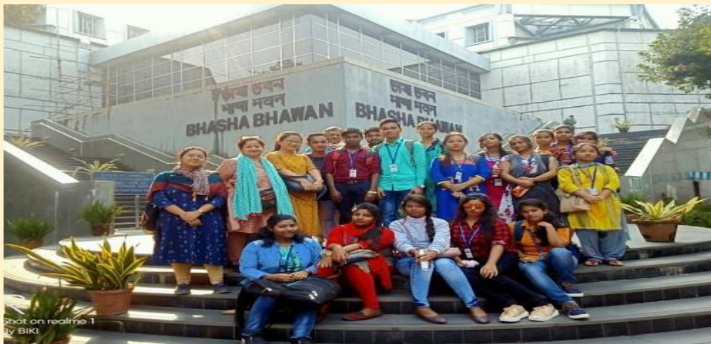
Educational trip to National Library