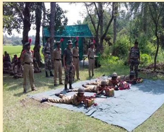
Practice during NCC Camp