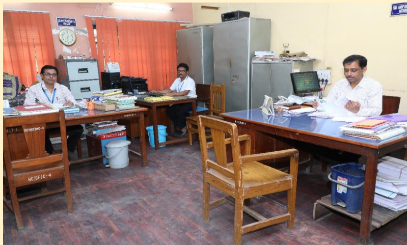
Office and Non-teaching Staff