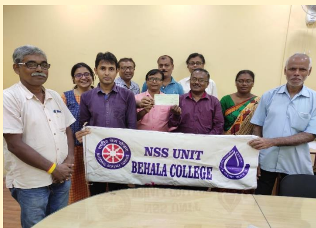
Donation for Tribal welfare