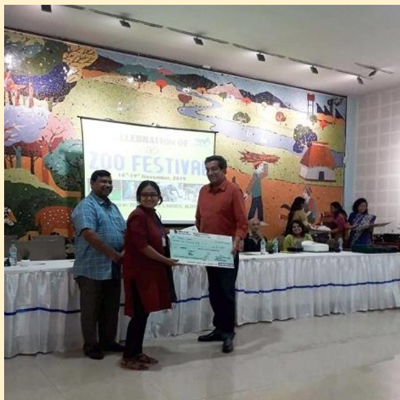
Students' participation in Zoo Festival