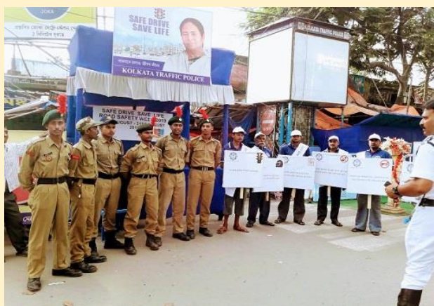
Participation in 'Safe Drive Save Life' campaign