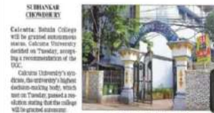
Behala College.

Behala College, a state-owned college that received the highest possible rating from the National Assessment and Accreditation Council (NAAC) in early 2023, had been informed by the UGC about the autonomous status, directing it through Calcutta University.